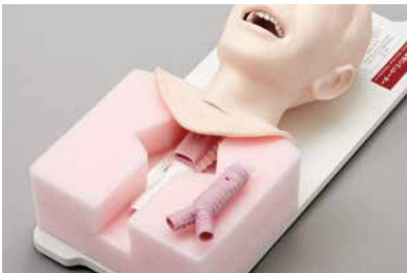
Washing of the bronchi