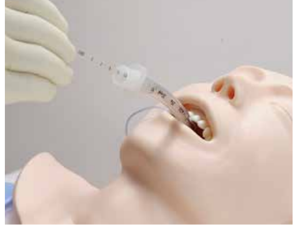
Suction of secretions in inserted tubes