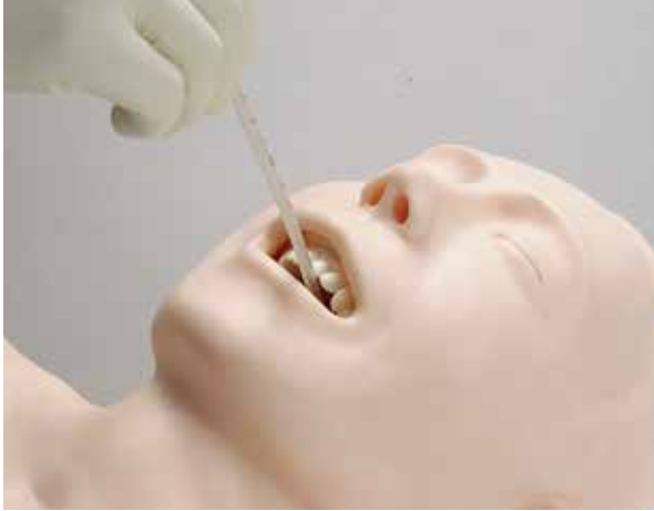
Suction of secretions in the oral cavity