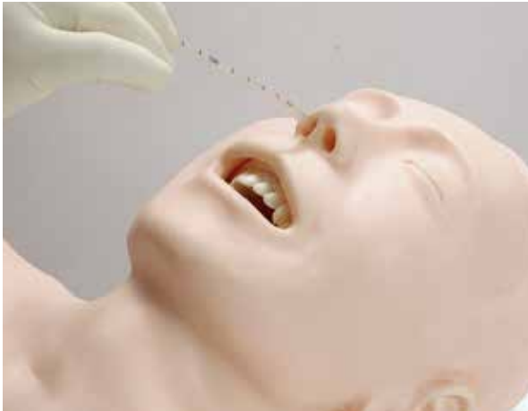
Suction of secretions in the nasal cavity