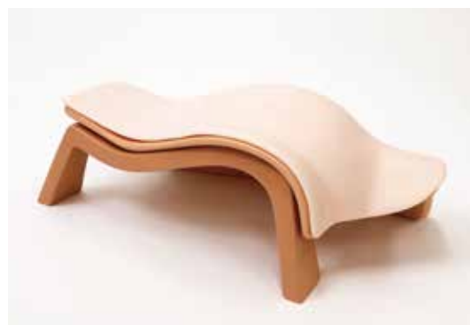
Also possible to practice by using exclusive stand.