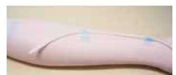
Exclusive tape (2type)