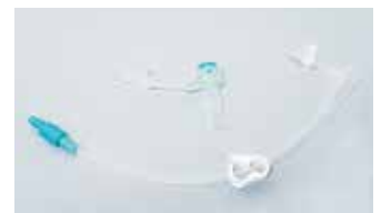
Simulated gastric fistula catheter

! I.V.Pad (1 piece) is included in New TOMOKO