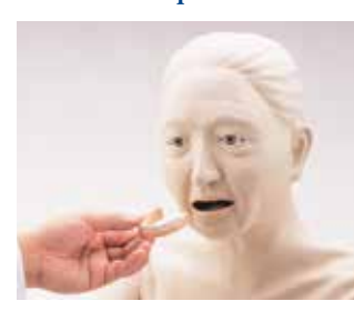
Rhythmic lifestyles Dentures are removable, and oral care can be performed.