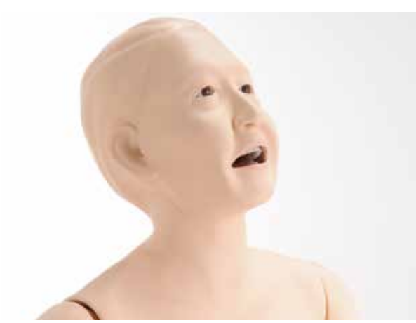
"The head moves not only front and back, but also right and left, making practical training possible as if on a real human body.