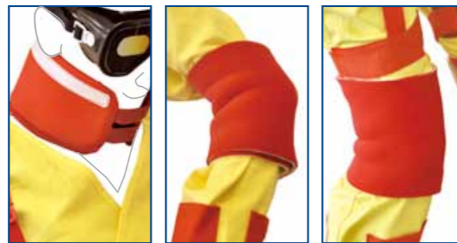
Neck restriction belt