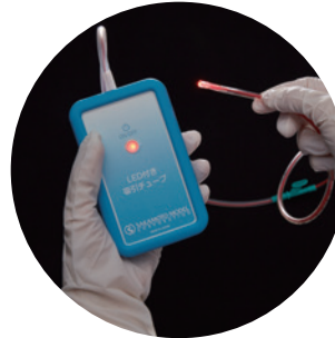
▲Exclusive suction tube