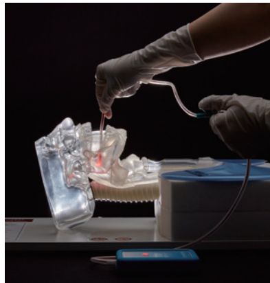
Suction position of pyriform sinus