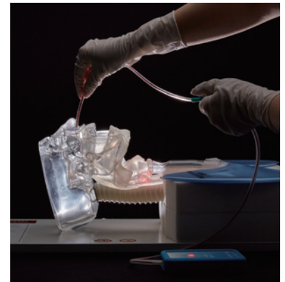
Suction position of bronchi