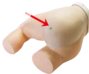
Ischial tuberosity - great trochanter