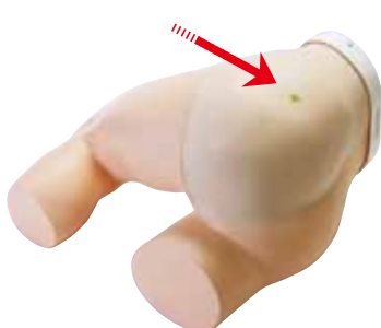
Posterior superior iliac spine - great trochanter