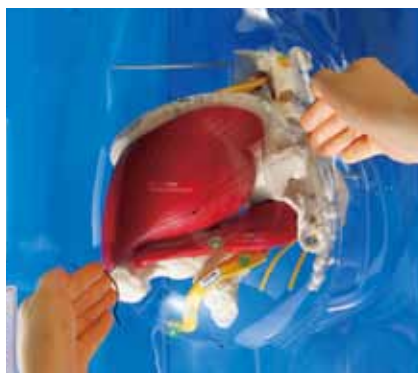
Posterior superior iliac spine - great trochanter