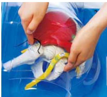
Ischial tuberosity - great trochanter