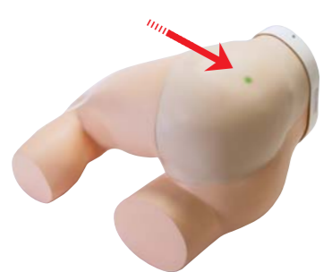
Posterior superior iliac spine - great trochanter