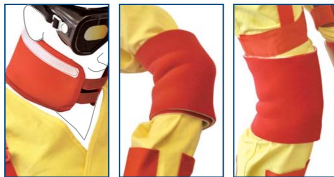
Neck restriction belt