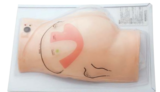
The drawing of injection site is written on a transparent package.