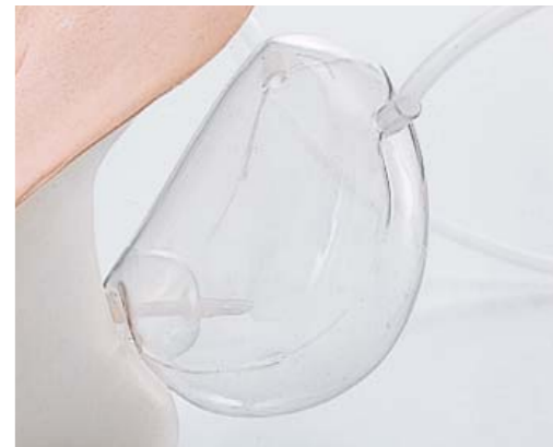
Can observe indwelling condition of balloon catheter and flow of urine!