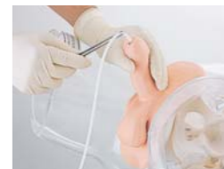
Can practice proper catheterization.