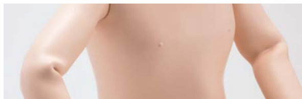
Movement of joint is real.