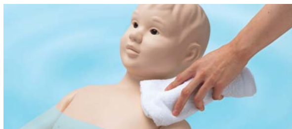
As whole body is seamless, can put into hot water for bathing.